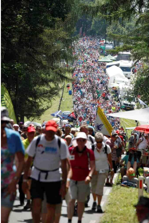
Day 3 of the Four Days Marches is known as the 'mountain stage' thanks to its hilly route.

All images below are duty free available on demand. Please contact: communicatie@4daagse.nl