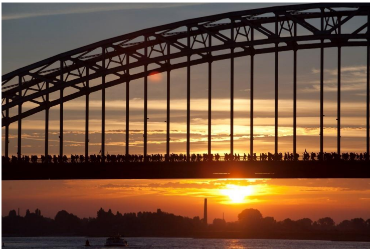
The 40,000-strong army of walkers crosses the bridge over the River Waal just outside Nijmegen into the Betuwe region on Day 1 of the Four Days Marches.