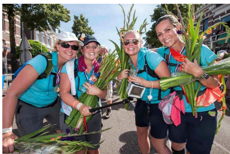
Receiving the Four Days Marches cross upon successful completion of the marches.