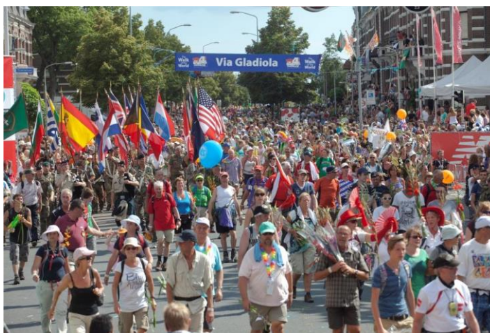
The glorious entry of all walkers on the last afternoon of the Four Days Marches in Nijmegen.